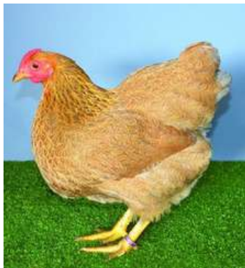
Champion Blue Partridge Hen (Hunter Valley Show) - Greg Clarke