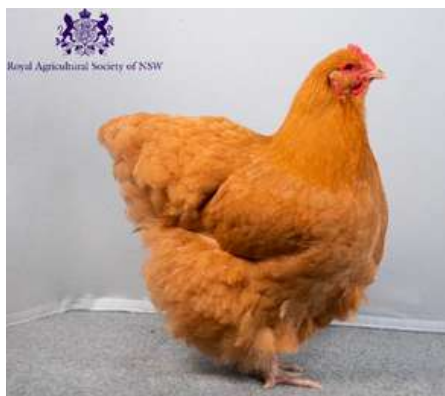
Champion Standard Buff Orpington Pullet (Sydney Royal) - Maree Crowe