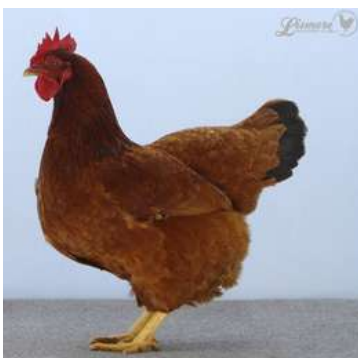
Champion Junior Bird (NCN) - Celeste Woods