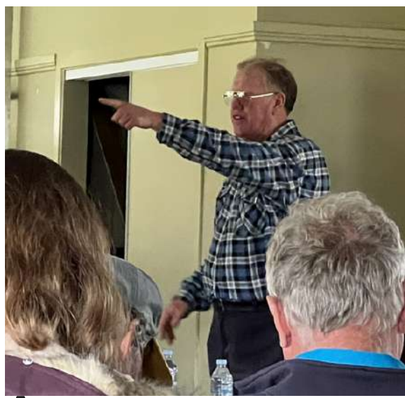
Lismore Poultry Club - August Auction